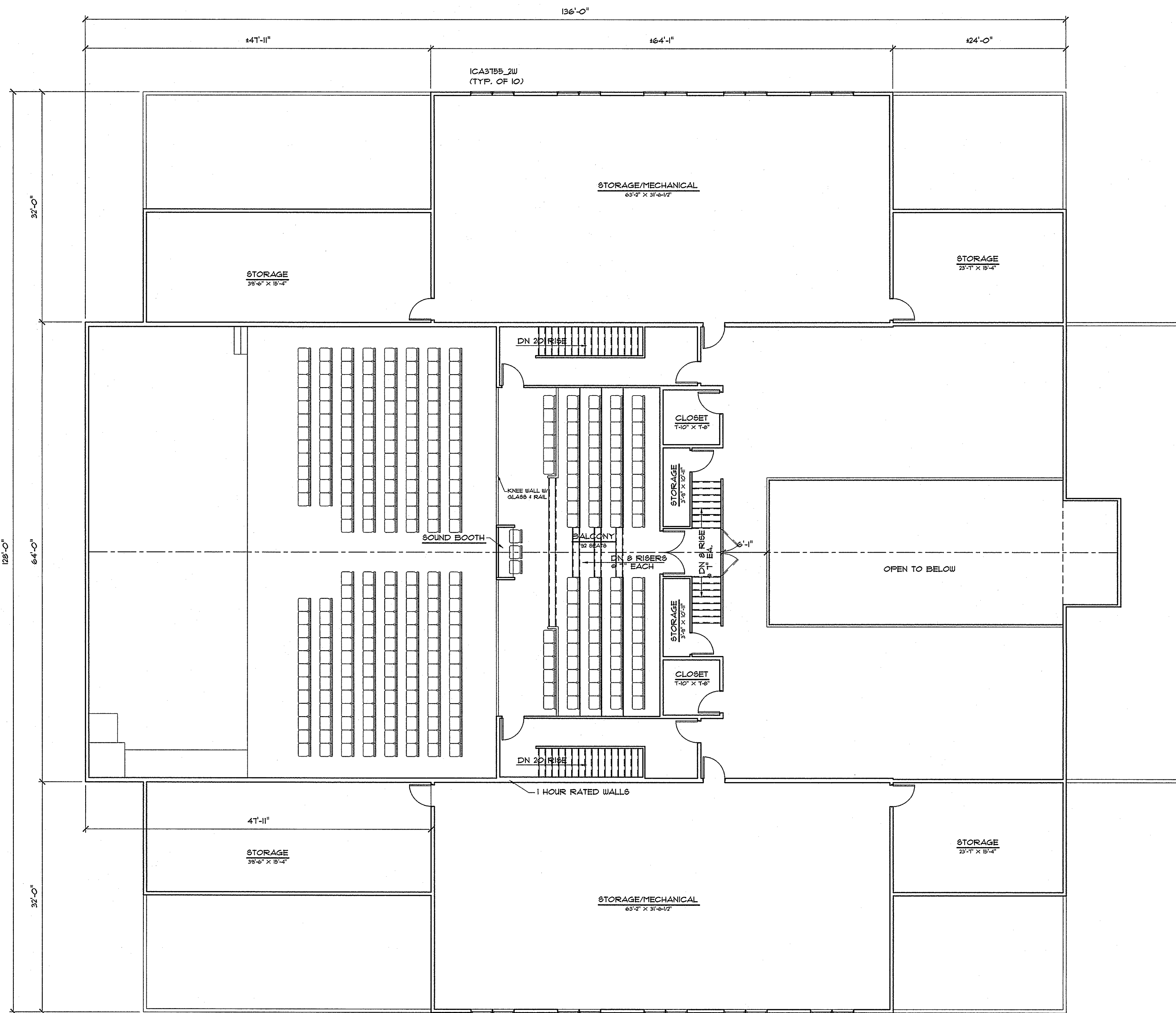
BALCONY/ATTIC PLAN SCALE: 1/8" = 1'-0" 1